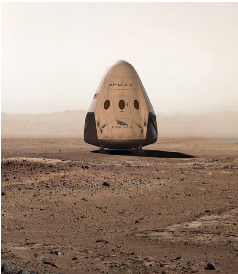
A SpaceX Falcon 9 achieving liftoff (below) and an artist's conception of a SpaceX Dragon 2 landing on Mars (left).