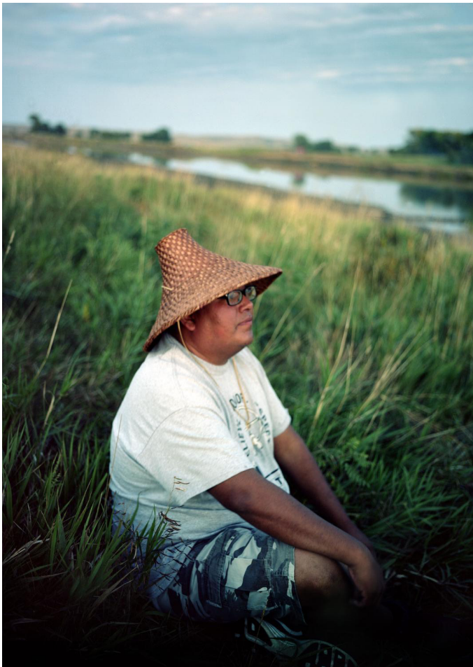
Members of the Red Warrior Camp and Standing Rock Sioux gathered to protest the construction of the Dakota Access Pipeline in North Dakota.

Undeterred, Jimenez continued to protest with the rest of the camp, and a few days later, their efforts were met with success.