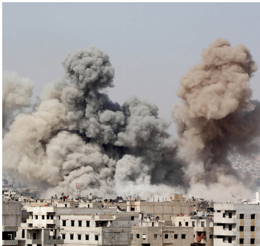
DIAA AL DIN

The summary of the matter is simple: Assad is using chemical weapons on civilians, denying it, and getting away with it. If other nations let him be, he will continue. To help, we have to set aside the ideas of national power and instead focus on helping the injured and the weak. To stop these attacks, we must set aside American interests, or Russian interests, or Syrian interests and replace them with humanitarian interests.