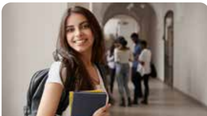
Stand out by mastering cutting-edge skills

At Tactory, we are passionate about empowering Students, Graduate or Professionals with the skills they need to thrive in today's dynamic business environment. Our comprehensive training programs cover a wide range of topics, including the latest trends in IT, Leadership Development, Sales & Services, Personal Effectiveness, Soft skills training, Communication development, Team building etc. Our expert trainers have years of experience in their respective fields and use a hands-on approach to deliver engaging and effective training sessions. We offer both online and offline training options, ensuring that our clients have access to the best training resources, no matter where they are located.