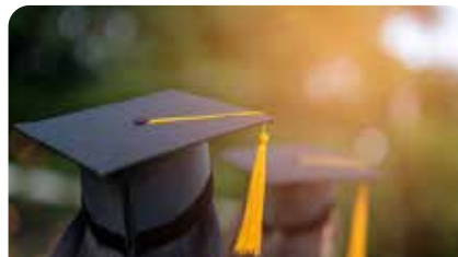
Enhance your capabilities for starting big and making an impact