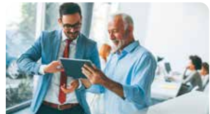
Be a sought-after specialist in your field