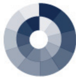
Pantone 540 U