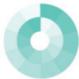
Pantone 325 U